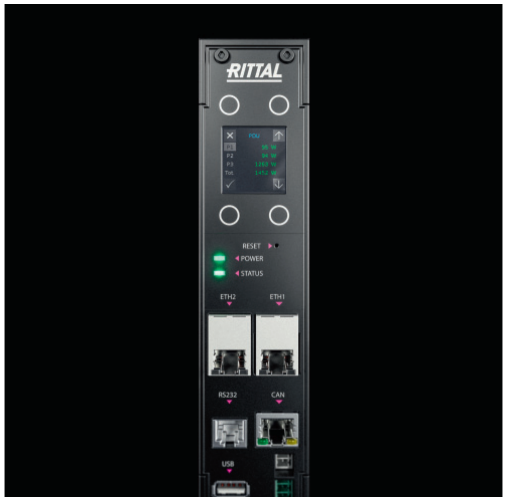
Figure 3: For a visual check, PDUs are also available with a display that shows the status of the power supply, for example.

However, even without the display panel, clear labelling is something to look out for when making a purchase. Colour-coding of the phases and clearly labelled A/B supply paths is ideal. If the individual slots can be highlighted with LEDs or other visual indicators, that is very helpful for service assignments, as technicians looking at the PDU can clearly see which devices are to be unplugged.