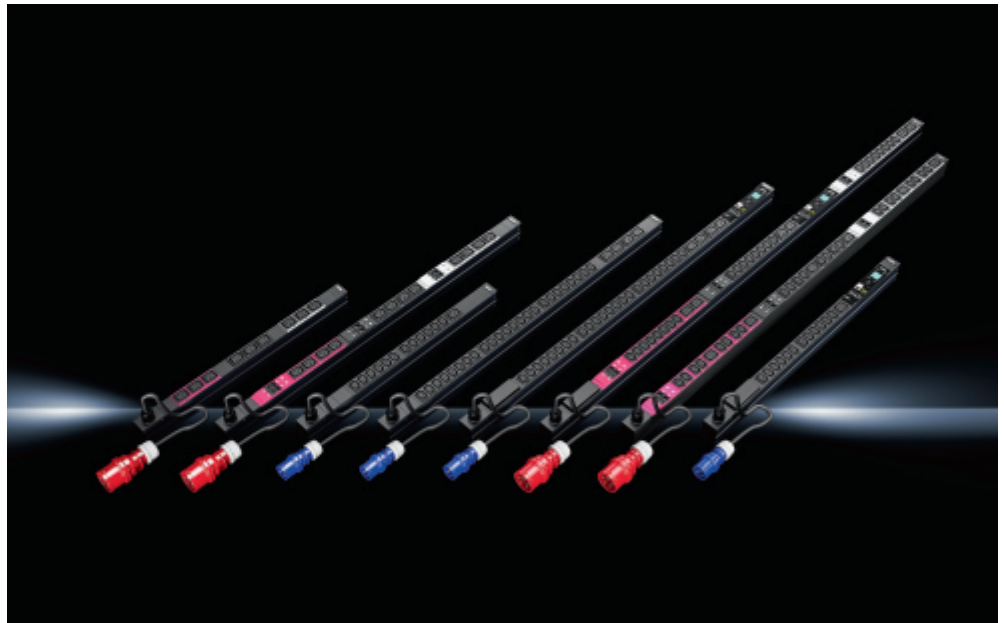
Figure 5: The Rittal PDU range consists of five basic models that build on each other's functions and are individually configurable.