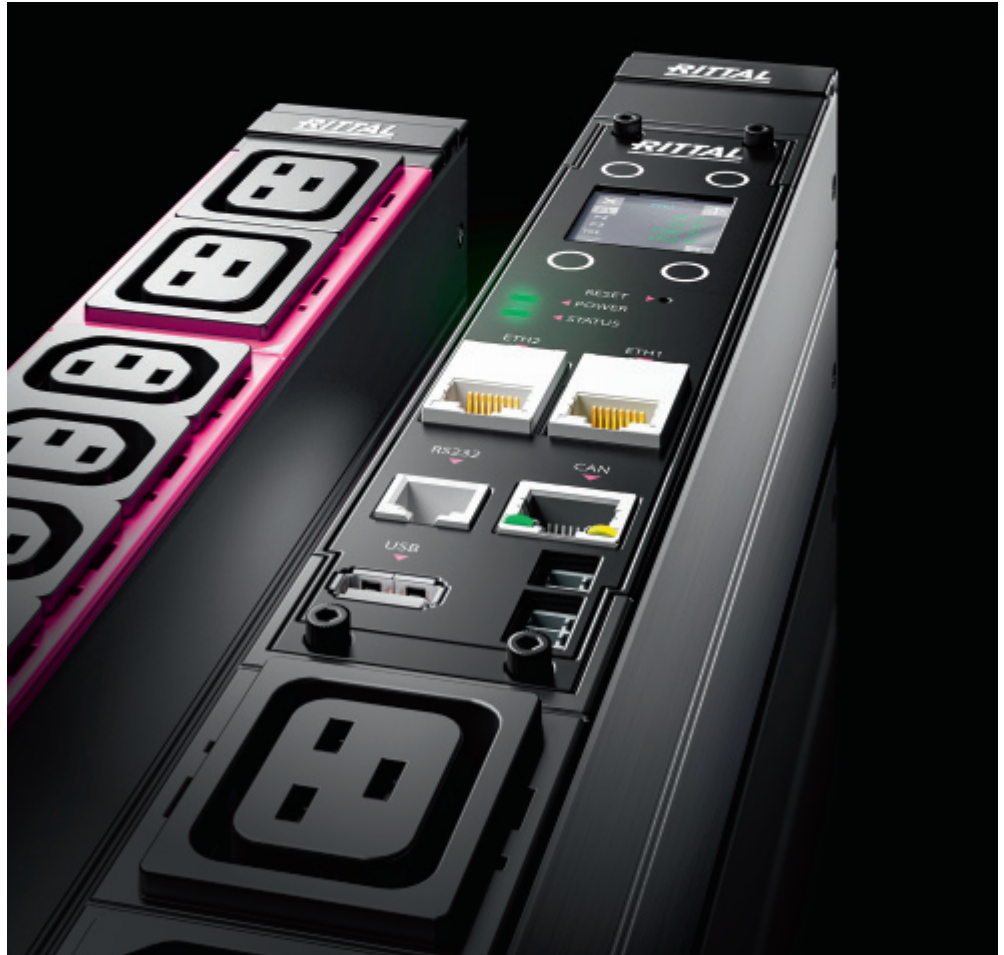
Figure 1: The comprehensive integration of the PDU into the IT infrastructure of a data center supports energy management and monitoring.