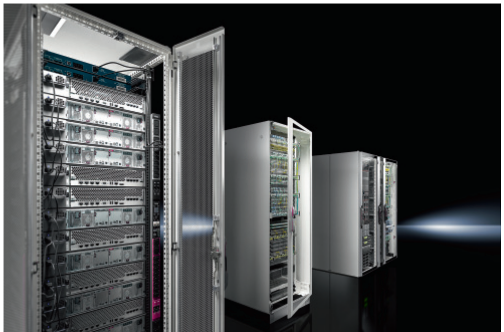
Figure 4: Technicians can install Rittal PDUs quickly and easily, without the need for tools. This saves valuable assembly time.

Any technician who regularly has to install PDUs will prefer tool-free installation. When using the conventional fixing method, it is also easy for a tool to slip and a sharp edge to cut into the cable insulation. No additional tools are therefore needed to install Rittal PDUs in Rittal IT racks, as they use a clip attachment in the zero-U-space on the 19" frame. This installation does not restrict access to the 19" level, meaning network and power cabling can still be carried out there and IT devices can be retrofitted while the rack is operational.