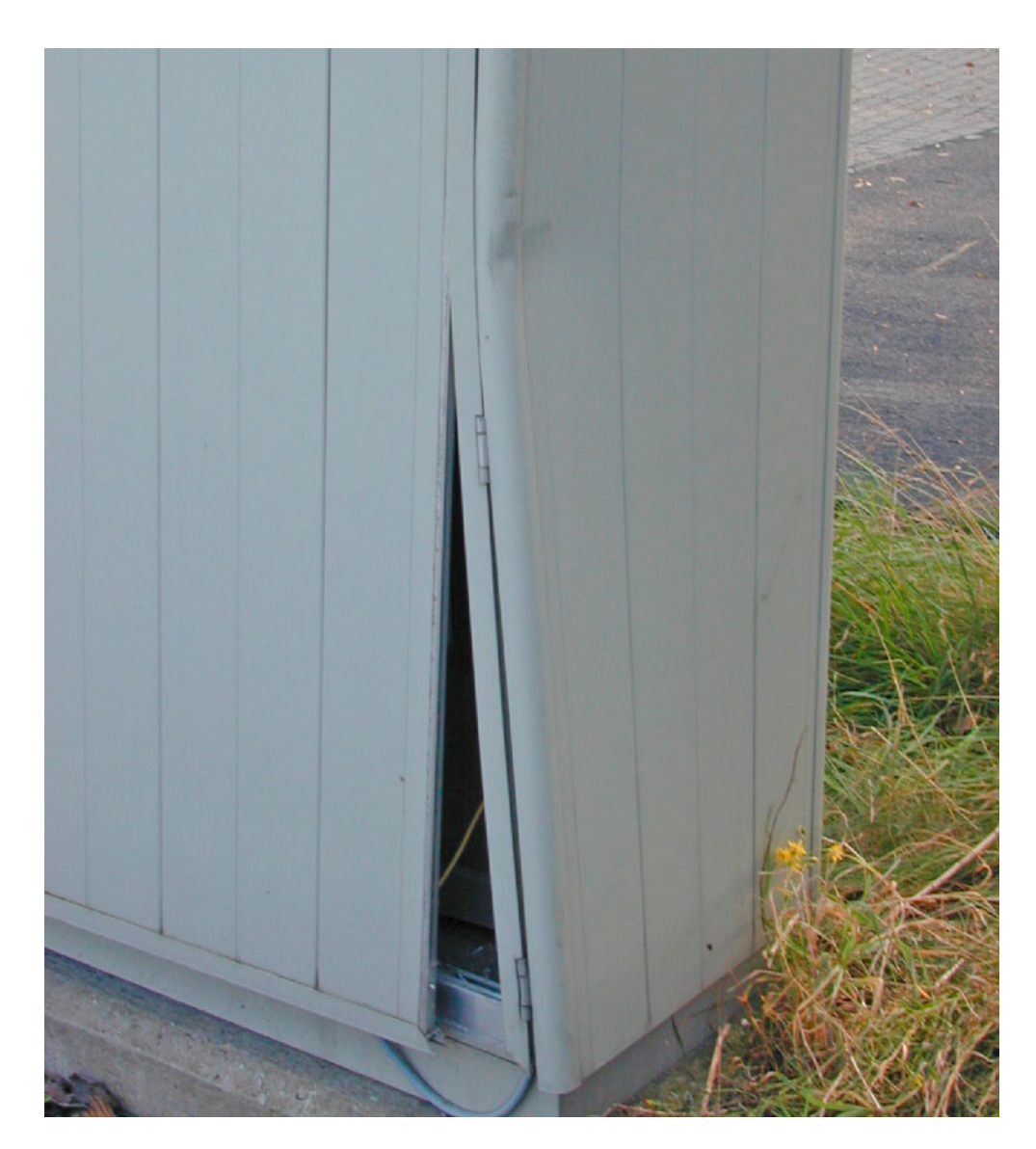
Figure 1: Deformed enclosure following the application of force

Damage to enclosures can impair the function of the equipment installed within (e.g. the control systems of machines) or even, in the worst case, render it non-functional. Accordingly, in addition to IP protection (protection against dust, contact and water), enclosures must also have an adequate level of protection against external mechanical forces.