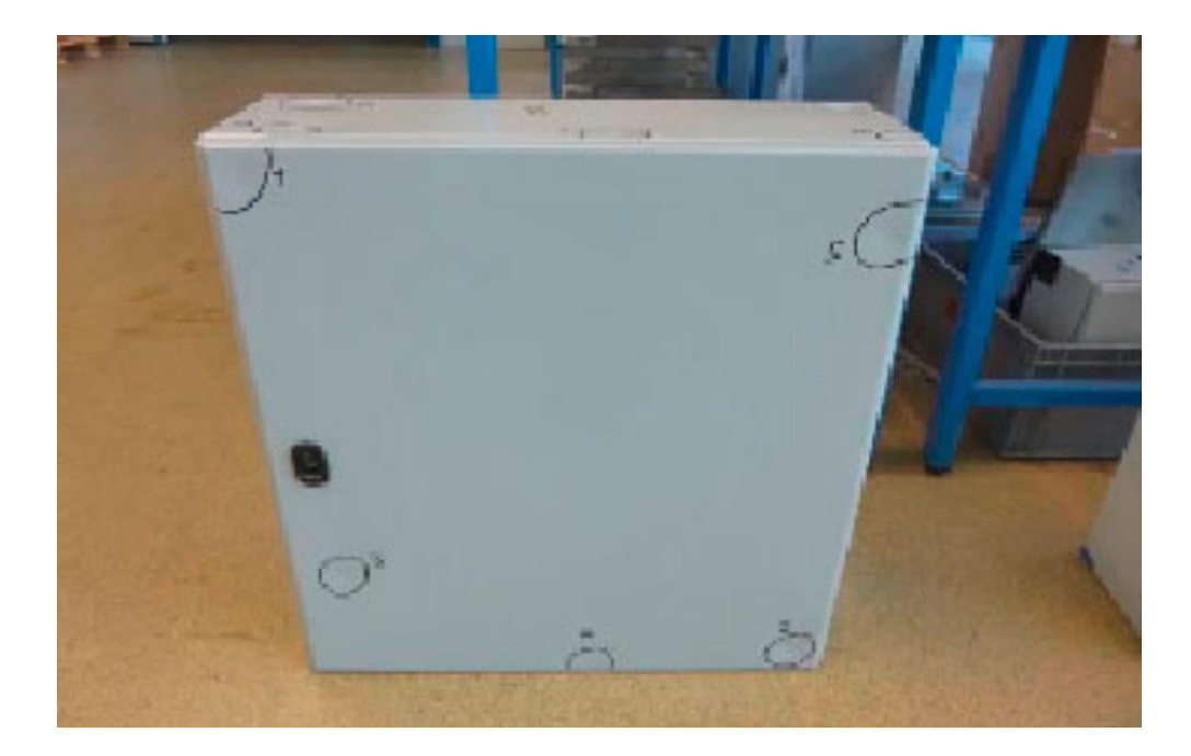
Figure 3: Enclosure in the test laboratory

The enclosure must be appropriately fastened during the test, in the same way that it is used under everyday conditions. This means, for example, that the enclosure may not be tested when freely suspended, as it then is not fixed securely and this is not how it is normally used. Fixing it to the floor or a wall corresponds to the conventional place of use and the requirements of the standard.