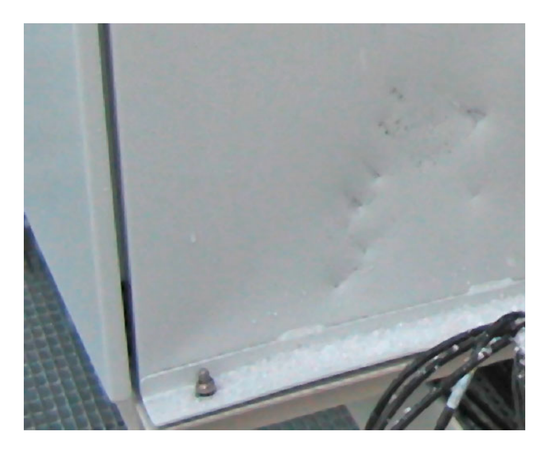
Figure 2: Stress on the enclosure

Besides the IP protection category, the IK Code as per IEC 62 262 is also of significance. This standard defines the classification of the impact resistance of an enclosure, i.e. the degree of mechanical stress or energy impact on the enclosure from the outside. IEC 62 208 states that empty enclosures must retain the IP protection category, as well as the insulation capability and the functions of the housing and its interior. The enclosure should be of good quality, especially where the risk of damage from pallet trucks, forklifts and the like can be expected.