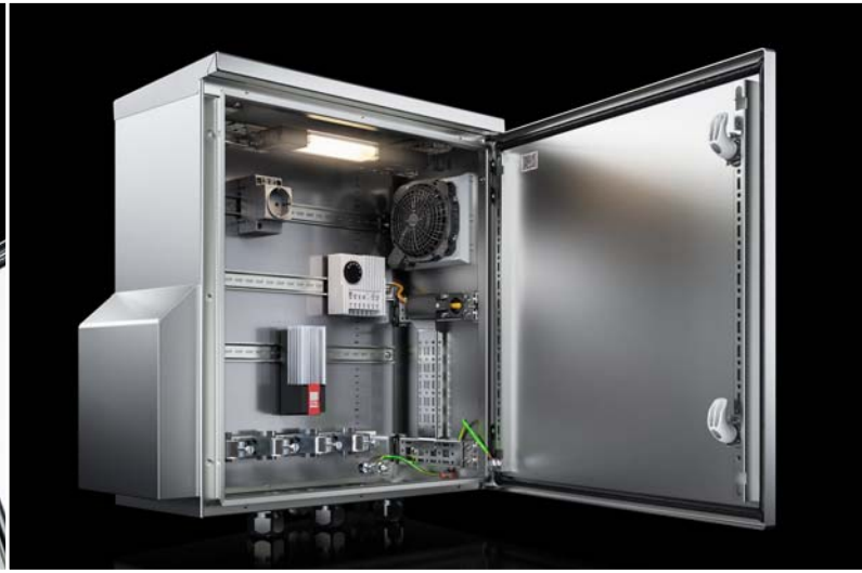
Comprehensive range of accessories from our modular system