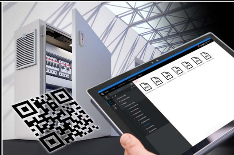
Digital wiring plan pocket Rittal ePOCKET for access to constantly up-to-date machine and plant documentation

You can find the contact details of all Rittal companies throughout the world here.