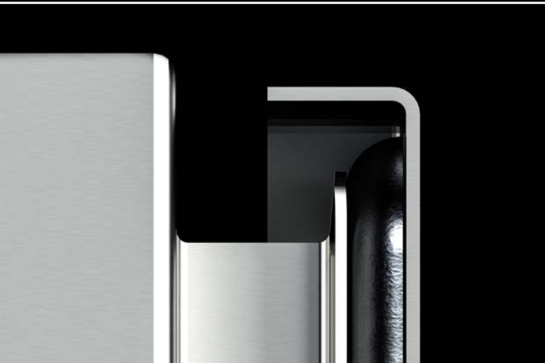
High protection ratings (up to IP 66/IK 10) thanks to the flat design of the enclosure edge fold